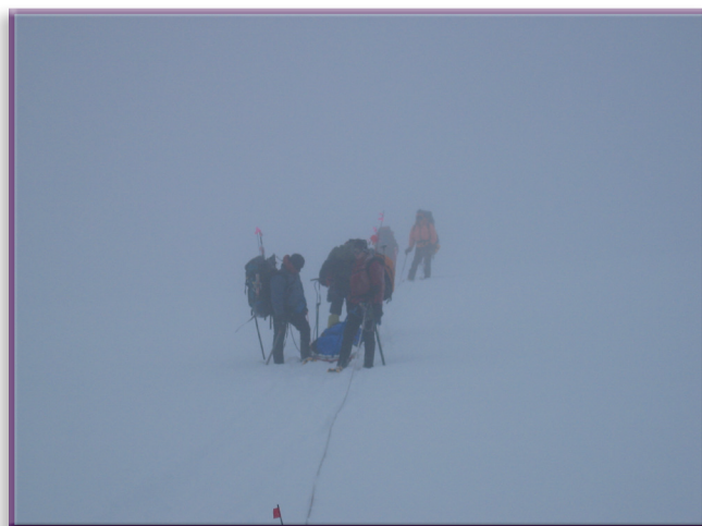
Movement back to LZ in white-out (no fly weather).