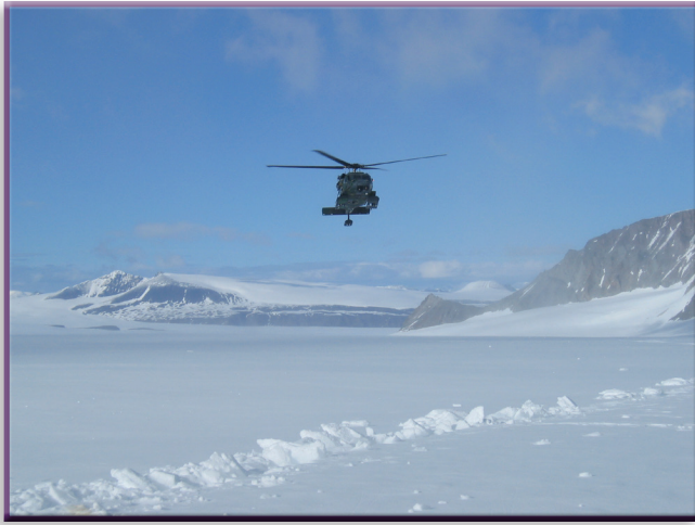
HH-60 on approach to recover patient and rescue team.