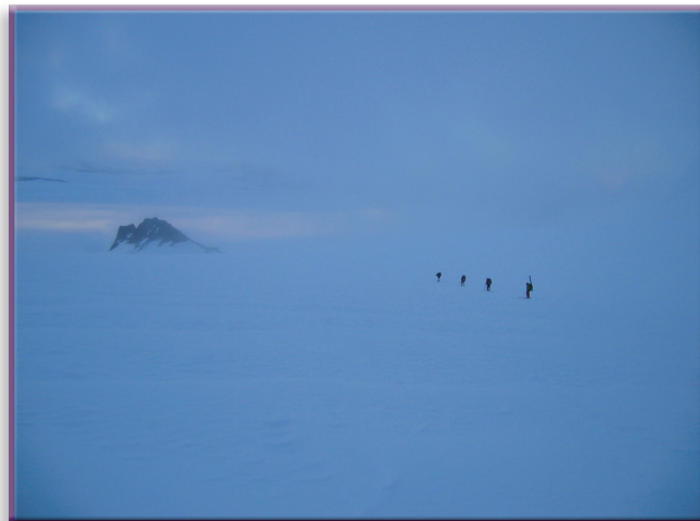
Movement to patient.