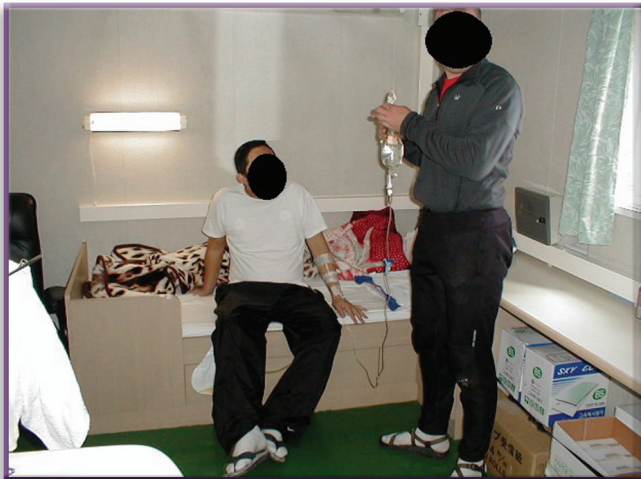
The crewmember was treated on a civilian freighter. Prior to transload to the helo, the patient regained mobility following administration of pain meds and antibiotics.

*Native Russian speaker located on KAB short notice – proved invaluable to 353SOG coordination with Ukrainian crew.