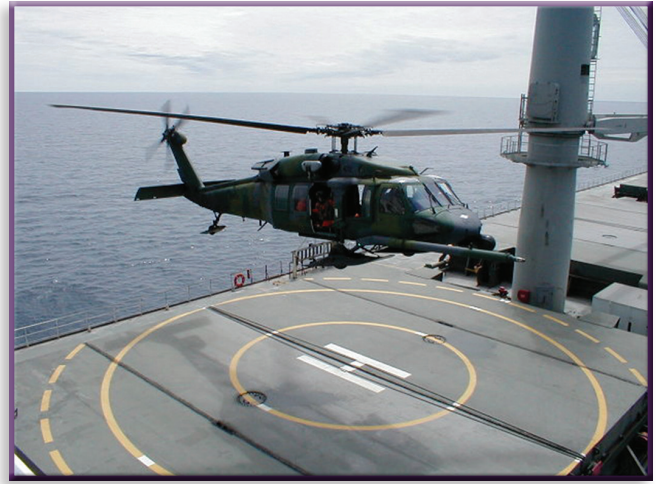
USAF HH-60 landing on freighter to receive sick crewman.